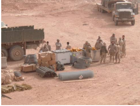
At left, Seabees unloading polling site materials. Below, a Seabee constructs an anti-vehicle berm.