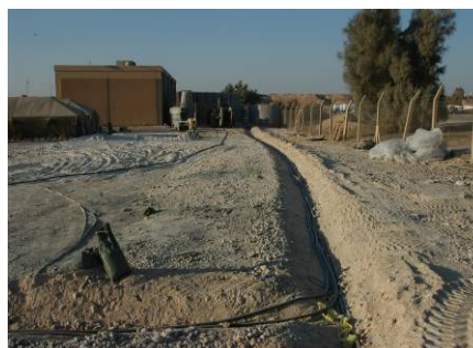
Trenching for electrical upgrades