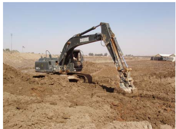
Using an excavator to improve drainage