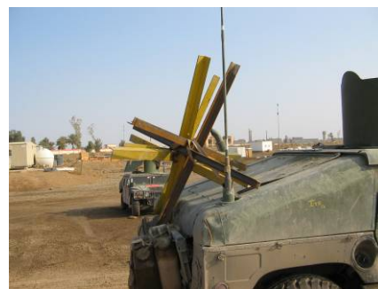
Steel traffic devices fabricated for 2/5 Marines