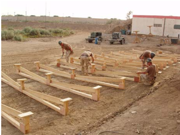
Erecting a SWA hut