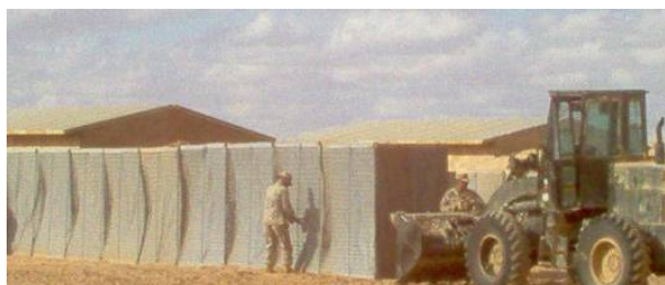
Placing Hesco barriers for force protection