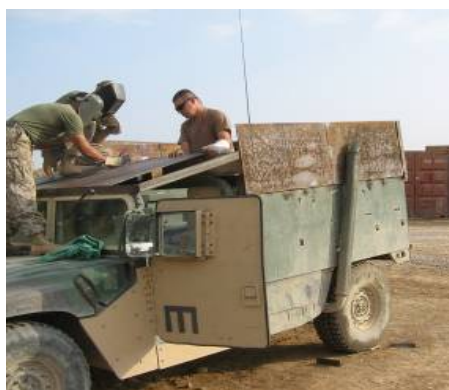
Welding steel armor on Marine vehicle