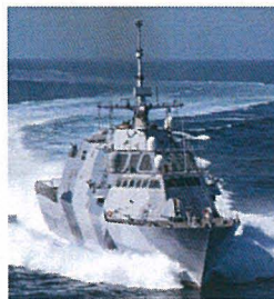
USS FREEDOM underway in the South China Sea 11 February 2013